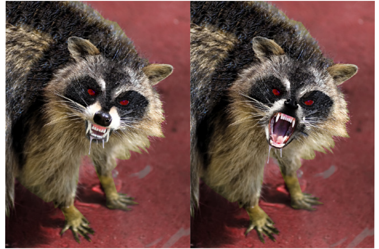
Angry Raccoon is one in a series of free Angry Animals Apps, and can currently be downloaded for all Android and iOS devices.