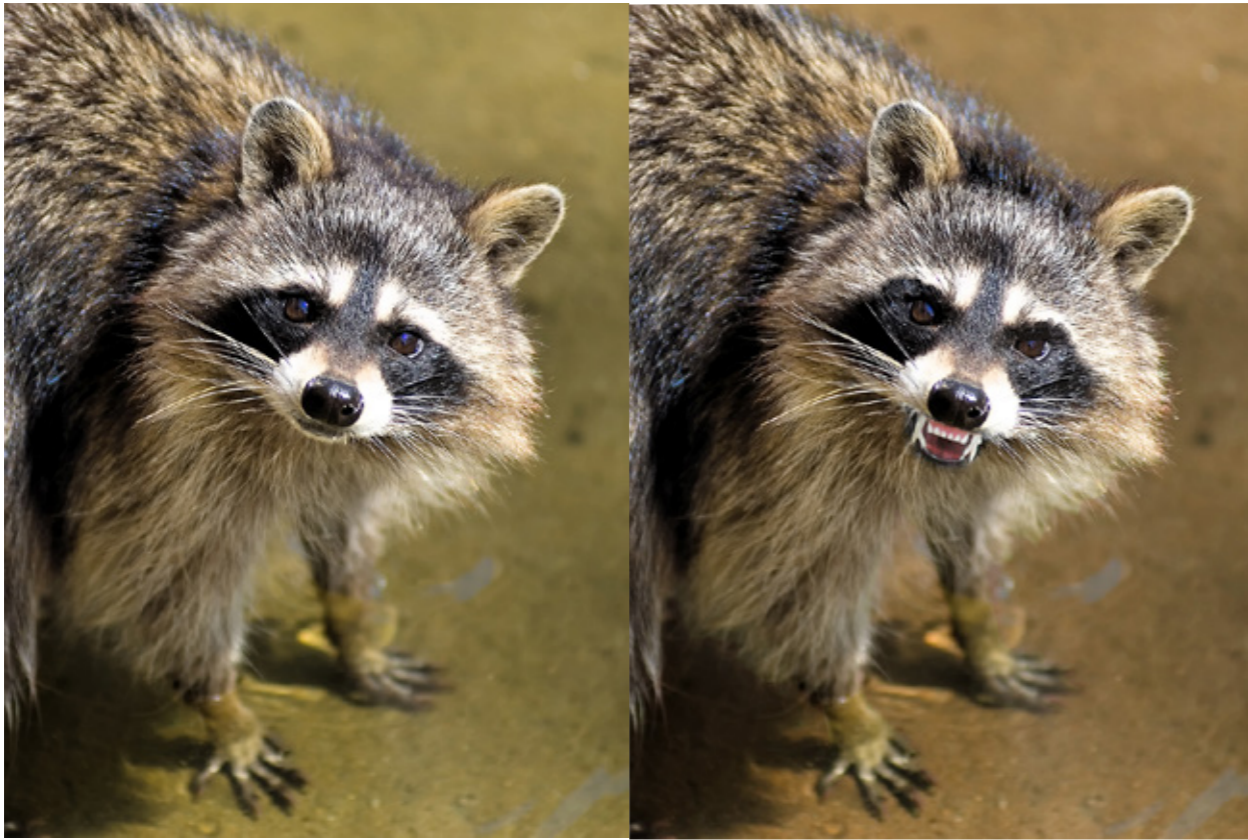
These photos are a sampling of the images, created by Brad, which were used for the smart-phone and tablet app - Angry Raccoon by NolaSoft.